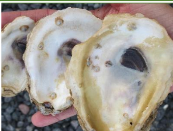
Spat on Shell